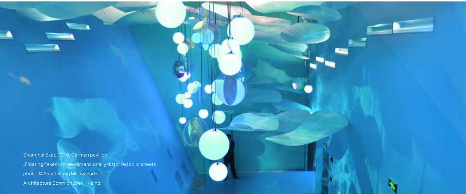
Shanghai Expo 2010, German pavilion „Floating flakes“, three-dimensionally distorted solid sheets

and plain material goes beyond the ordinary.