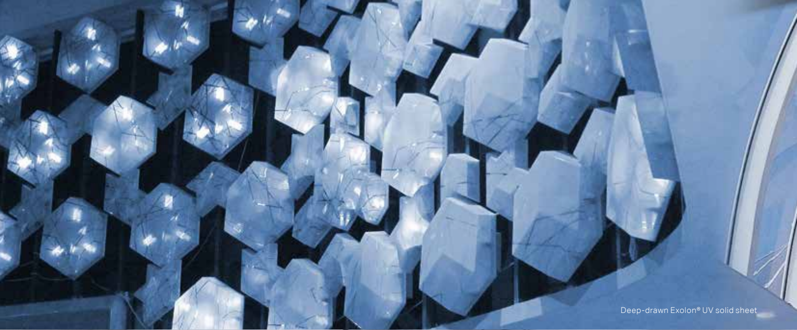
Deep-drawn Exolon® UV solid sheet