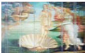
without special treatment

Exolon Group offers a complete portfolio of polycarbonate multiwall sheets to meet the most diverse needs. If meant to serve as partition walls, sheets should have a thickness of less than 16 mm in order to ensure that the structure is adequately lightweight. All sheets are available in a selection of colours (opal, bronze, blue, green) to fit with a range of design schemes.