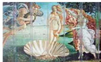
with special treatment